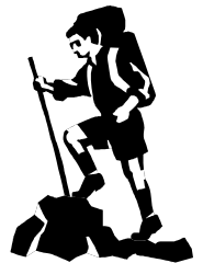
Take a nice walk through a park and enjoy the colors of fall!